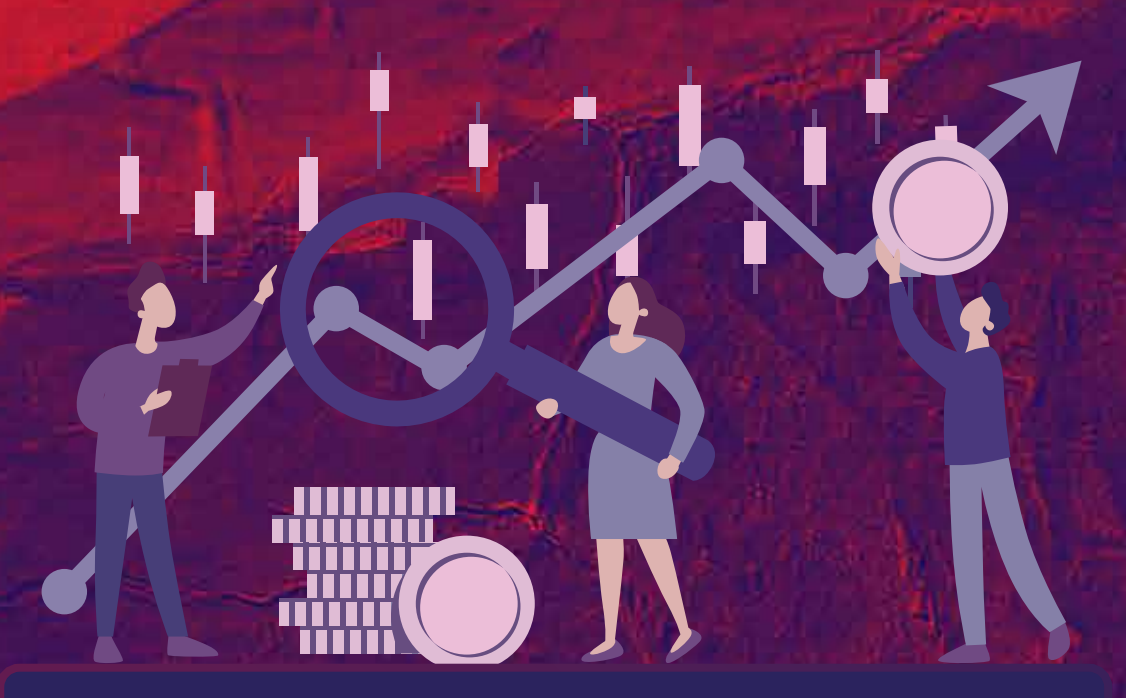
Improving Macroeconomic Resilience