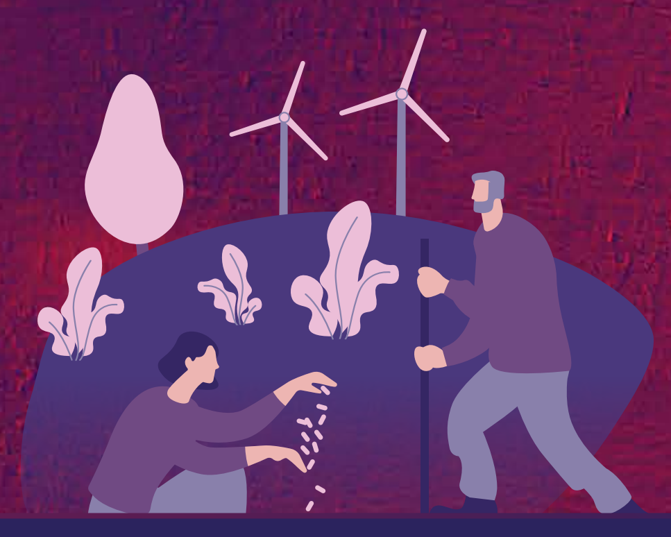
Creating Sustainable and Resilient Agriculture Food System